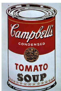
"Campbells Soup Can"