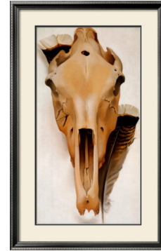
"Mule, Skull and Feathers"